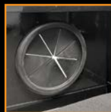
Rubber access gromet on chests