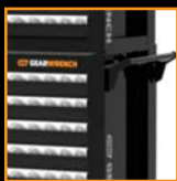
Heavy duty handles