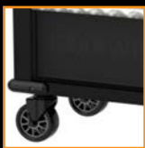
Bumpers on all corners