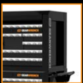
Clam Shell lid