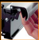
Trigger lock drawer system