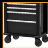
x4 swivel castor wheels, 2 wheels are locking