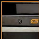
Barrel style lock & key