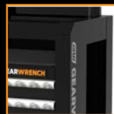
Wider & stronger reinforced frame