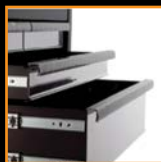
Double ball-bearing drawers