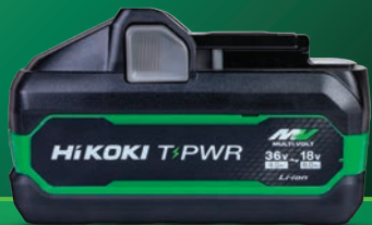
BSL3640MVT HIGH OUTPUT TABLESS BATTERY