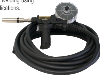
SUREGRIP SP24 200 AMP