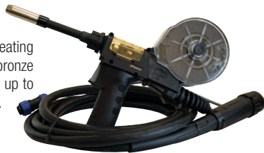
SUREGRIP SP15 150 AMP

$785.00 Including GST $682.61 excluding GST XASP15-24-P1-60ER